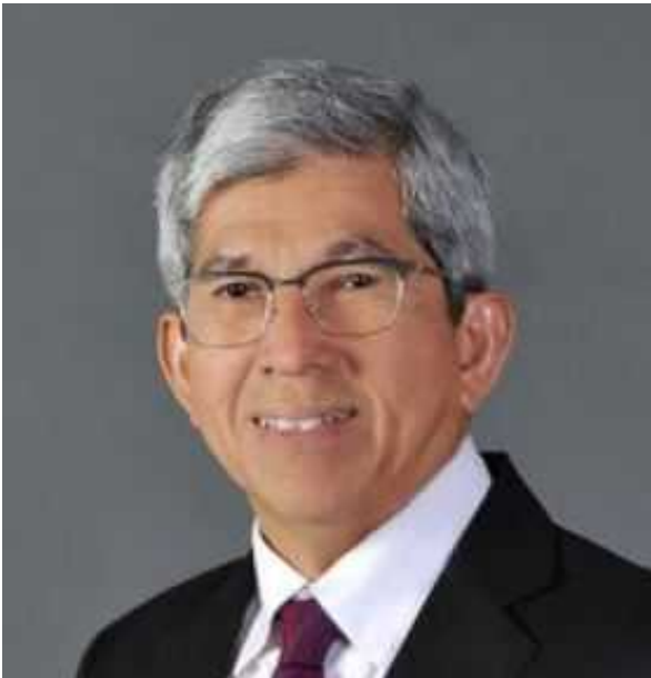
Professor Yaacob Ibrahim Singapore Institute of Technology

Professor Yaacob Ibrahim is currently a Professor of Engineering at the Singapore Institute of Technology (SIT) where he is also Advisor to the President of SIT.